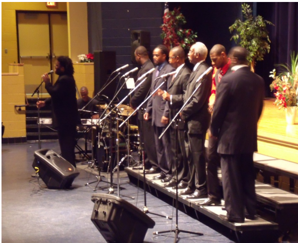
Men’s Day Choir